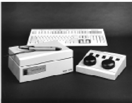
The VIA-170 is pictured here with optional knob controller, light pen and VIA-RGB interface.